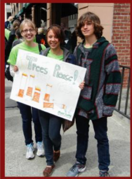
Youth Quest 2012